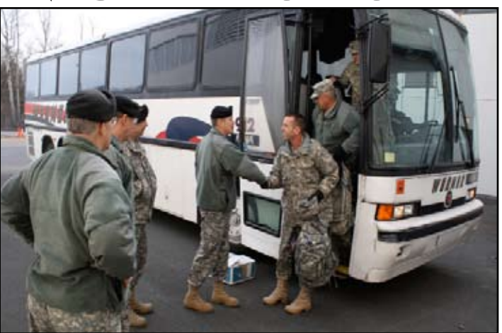
53rd ALT Soldiers return to DMNA after a successful year long deployment in support of Operation Iraqi Freedom.

Now, with the 442nd tapped to head to Iraq in the