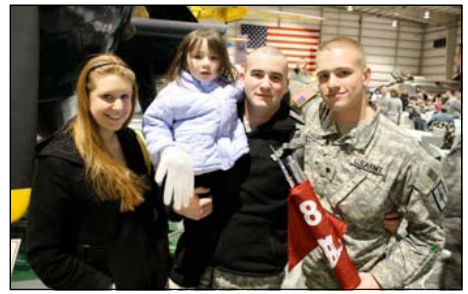
HORSEHEADS, NY --Soldiers and family members gather for last minute photos before the unit leaves for a one year deployment in support of Operation Enduring Freedom.

The deployment ceremony, hosted commander of the 53rd Troop by the American Red Cross, gave Command, assured the Soldiers of your families," he added. the Soldiers and their families' one and their families that the New more chance to be together and York National Guard would look be recognized for their sacrifices. after families at home as the Additional mobilization ceremonies Soldiers perform their duties in