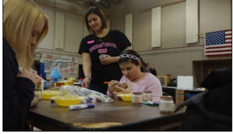
Family Support Volunteers from the NYARNG Family Readiness Program gather for a Mid-Tour FRG Event sponsored by the 206th Military Police Company currently deployed.

LATHAM, N.Y.-- The 206th Military Police Company, and the 1108th Ordnance Company (EOD) held a middeployment Family Readiness Group (FRG) meeting on Feb 20, 2010 at the Division of Military and Naval Affairs designed to begin the preparations for returning Soldiers coming home from deployment.