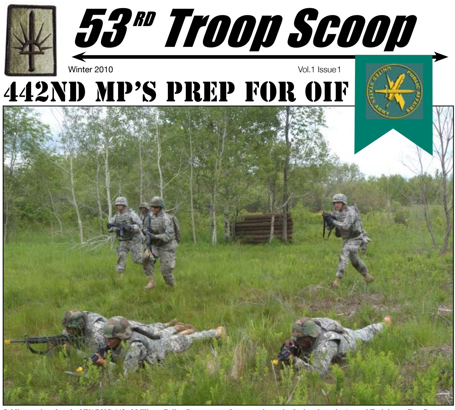
Soldiers assigned to the NYARNG 442nd Military Police Company perform warrior tasks during the units Annual Training at Fort Drum, NY. The unit is preparing for an upcoming deployment in support of Operation Iraqi Freedom.

Fort Drum, N.Y. -- It's early afternoon in this Iraqi village and the 442 Military Police Company just started their dismounted patrol, when out of nowhere they receive indirect fire and the ground rattles beneath them.