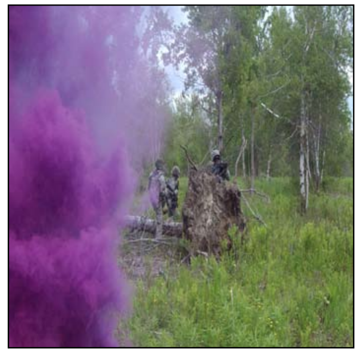
Soldiers of the 442nd MP Co. prepare for their upcoming deployment in support of Operation Iraqi Freedom.

the "Fighting 69th," MOUT is very important because the modern day battlefield revolves around urban