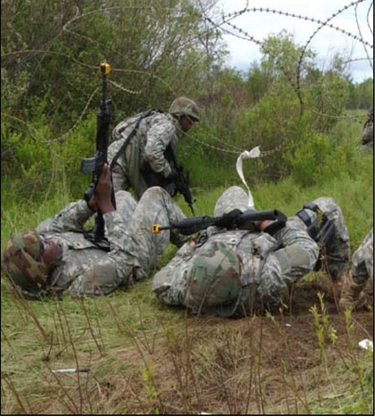
Soldiers of the 442nd MP's conduct warrior task training at Fort Drum while preparing for an upcoming deployment in support of Operation Iraq Freedom.

gave us a chance to learn how to work together as a terrain, and it is necessary for our Soldiers to succeed in