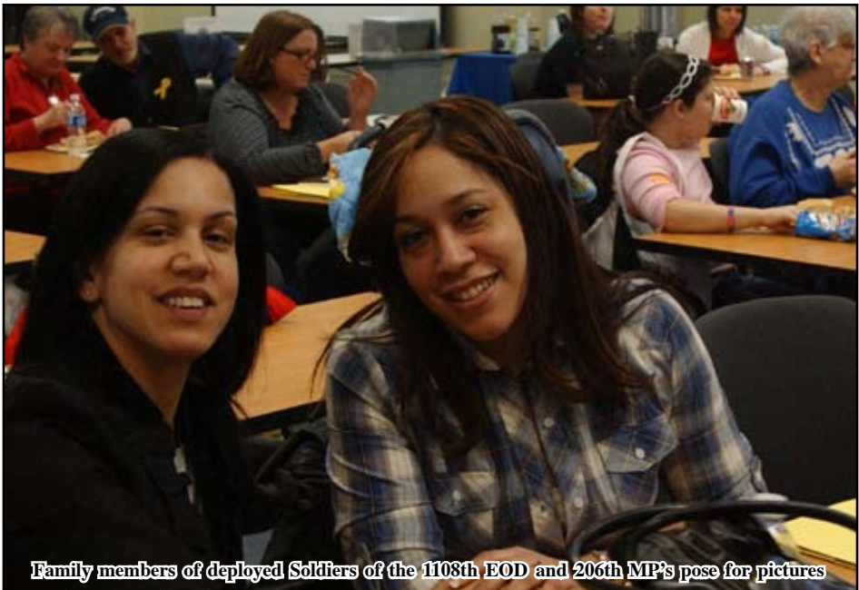
during the units Mithibur BRG Event held at DMNA, Latham, NY Echinary 20, 2010.

The 206th MP CO., is scheduled to return home to their families in the near future and the next step in the yellow ribbon program requires Soldiers to be present for paid assembles at 30 and 60 days after their return from a combat zone, and invite families Cont. Page 10