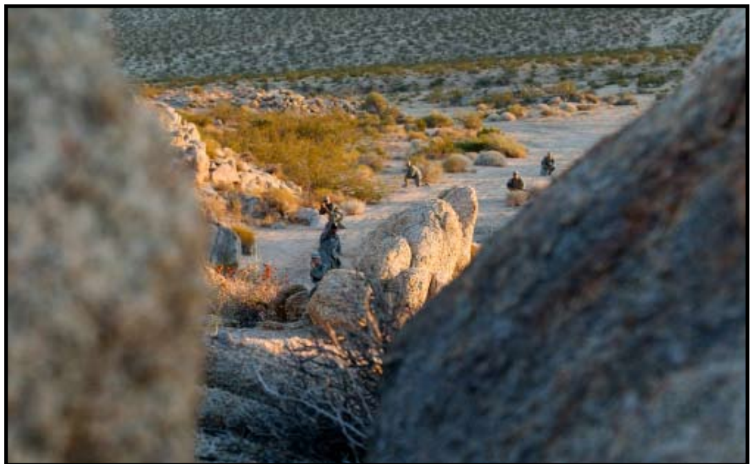
FORT IRWIN, Calif. -- Elements of the 14th Finance Co. advance through simulated enemy territory during a land navigation training exercise here, Aug. 10. The Finance Soldiers are training for an upcoming deployment to Afghanistan next year.

The DAGR system is a relatively new satellite G.P.S. It's more powerful and a quarter of the size of the old Precision lightweight G.P.S. Receiver systems, more commonly