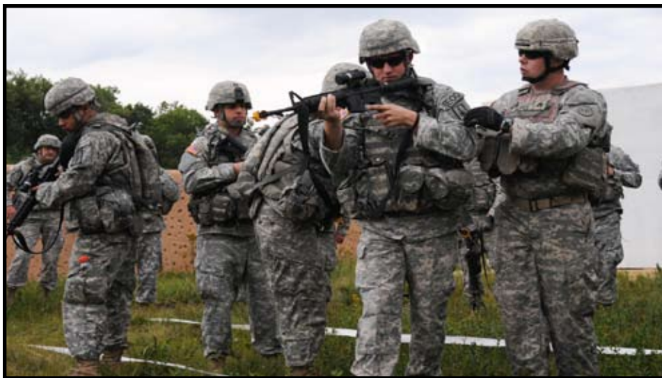
Soldiers with the 501st Ordinance Battalion practice urban assault tactics August 18, 2010. During a pre deployment training, the 501st prepare for entering buildings safely and tactically while overseas.

“PMT ensures assigned Soldiers complete all theater and destination