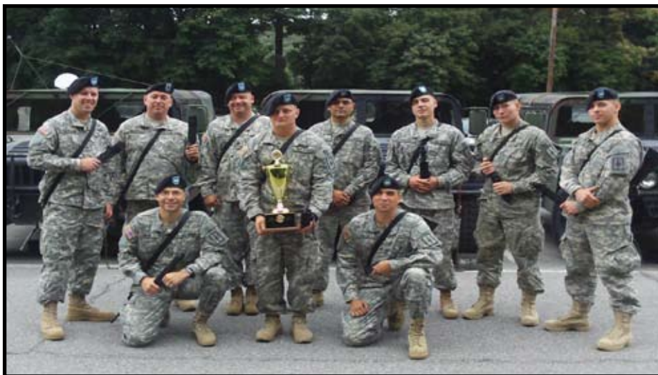
The Squad Stakes Team representing the Queensbury, NY, based 1427th Transportation Company (seen above) won top honors at the 53rd Troop Commands inaugural "Squad Stakes" held at Camp Smith Training Area, Cortlandt Manor, NY.

The 1427 Transportation Company received a trophy they will keep un-