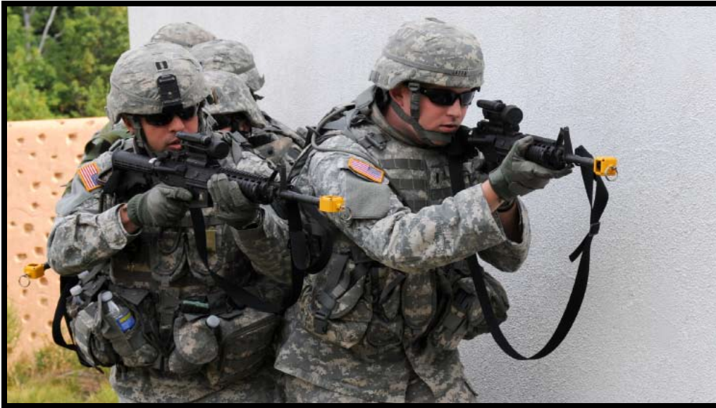
The 501st EOD Battalion trains on Fort Drum in preparation for a fall deployment on Thursday, August 18, 2010. The Soldiers work on moving tactically into a village safely and quickly..

Since its conversion to an EOD Battalion in it has sent technicians to both the Iraq and Afghanistan theater of operations. This will be the battalion headquarters’ first combat deployment since its conversion to an EOD battalion.