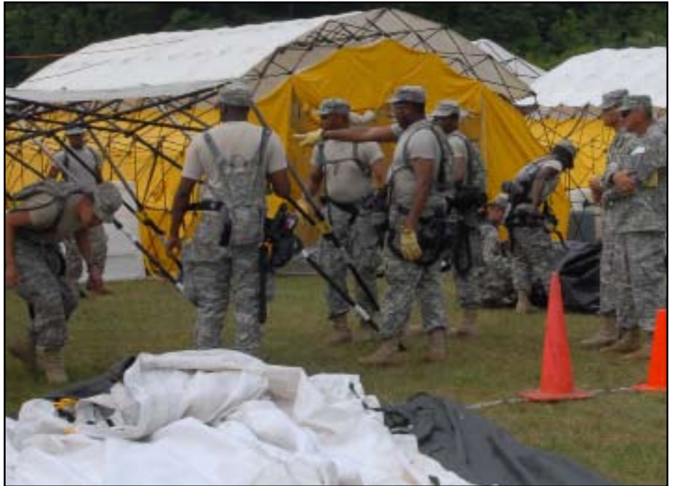
Soldiers assigned to the Kingston, NY, based 104th Military Police Battalion set up decontamination tents during CERFP training held during the battalions training and validation exercise held in July at Camp Smith Training Area, Cortlandt Manor, NY.