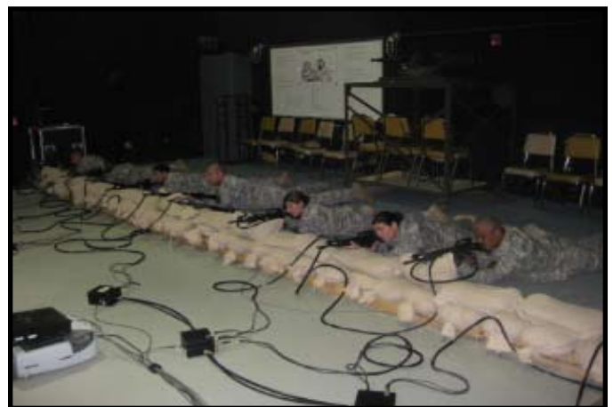
Soldiers of the 369th Sustainment Brigade practise on the EST 2000, an engagement skills trainer, at Fort Indiantown Gap, Pa., during the units September drill.