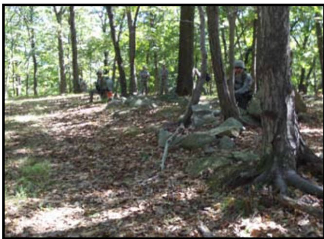
Competitors perform reconnaissance operations during the inaugural 53rd Troop Command 'Squad Stakes' held at Camp Smith Training Site, Cortlandt Manor, NY